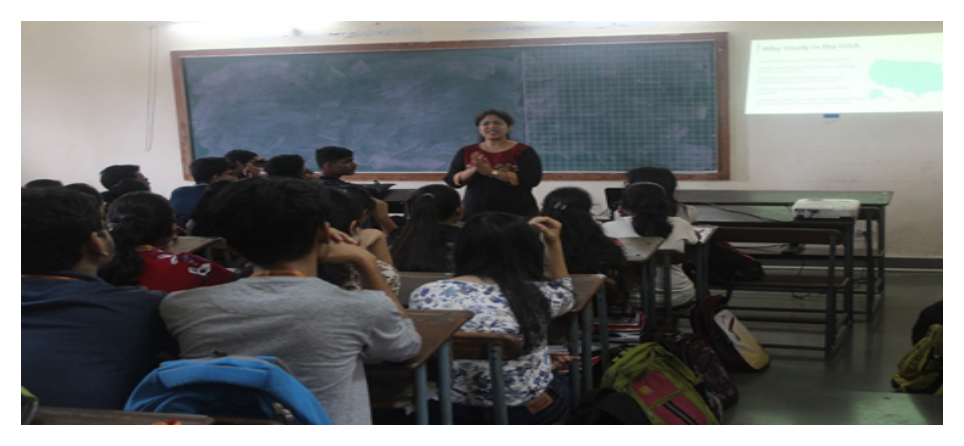
A seminar on 'How to prepare for GRE'