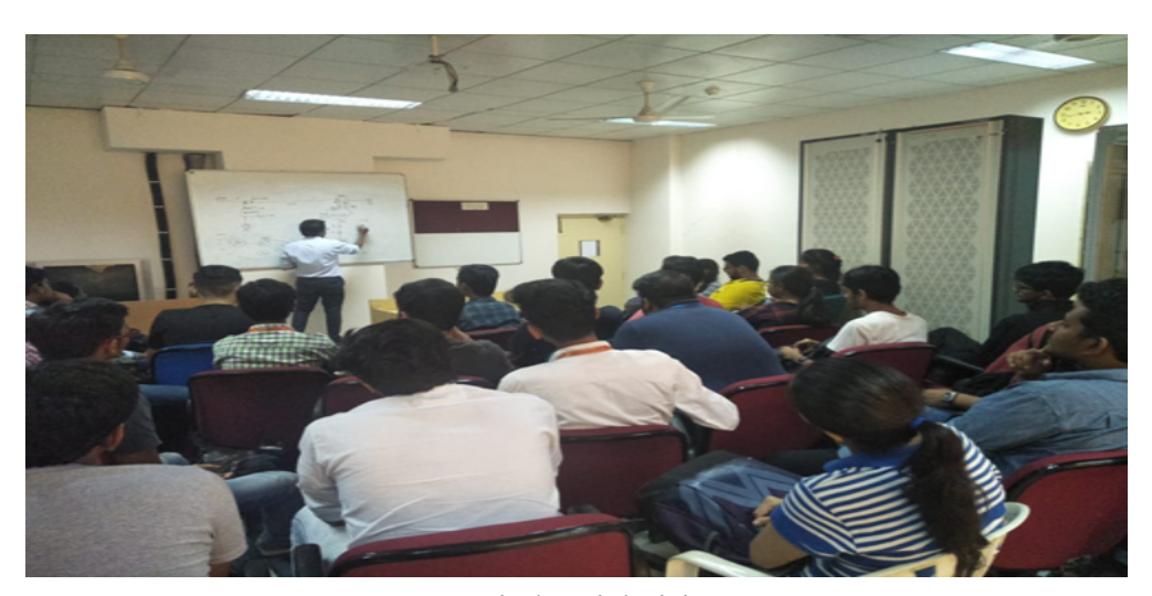
An industrial visit

7. On 29<sup>th</sup> September, 2018 students from COEPS Cell & NSS of K.J.Somaiya Institute of Engineering & I.T. celebrated Surgical Strike Day in a very unique way.