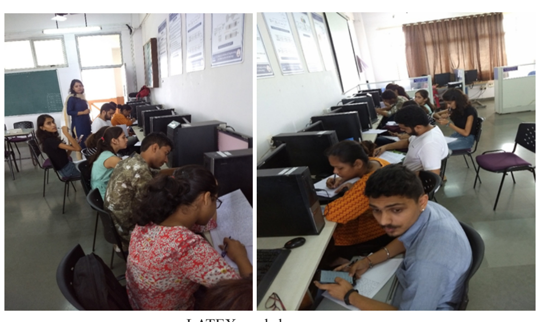
a LATEX workshop